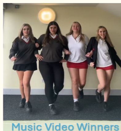
Music Video Winners